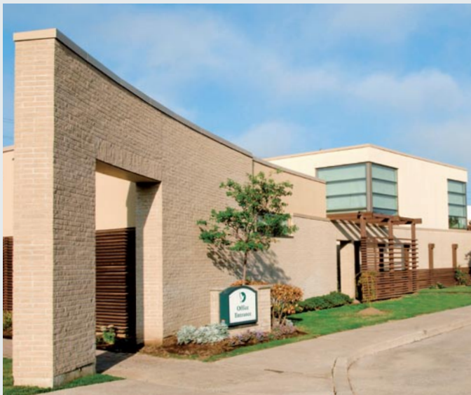
The Simple Alternative, Mississauga.