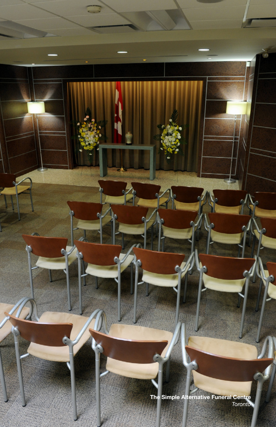
The Simple Alternative Funeral Centre Toronto